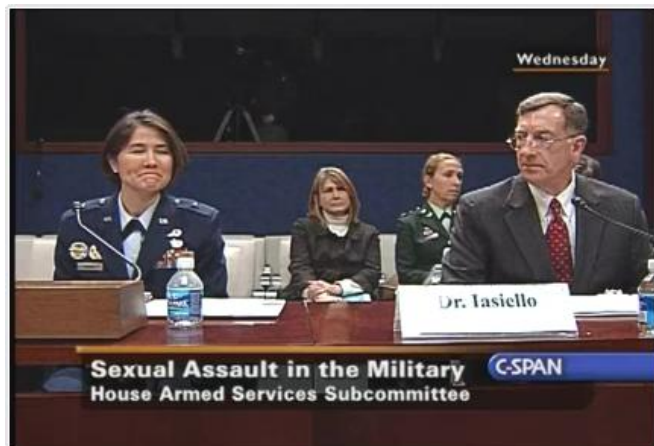
Witnesses testified before Congress on the report of the Defense Task Force on Sexual Assault in the Military Services.

In considering solutions to the problems of sexual assault and sexual harassment in the military, it is helpful to review a little history. While it is by no means the beginning of the story, the DoD first officially recognized the problem of sexual harassment in 1979, after media attention to the problem. In the early 1980s, the DoD created its first "zero tolerance" program for sexual harassment. In 1986, the Defense Advisory Committee on Women in the Services (DACOWITS) reported that sexual harassment was a major